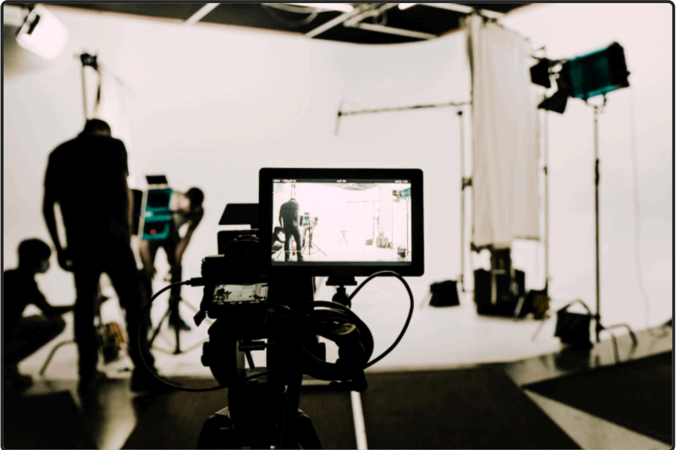
A typical video recording setup

During this stage, the focus is on planning and preparation. Workflow efficiency is crucial. Digital tools like rundown software significantly reduce the need for manual adjustments and reliance on physical documents.