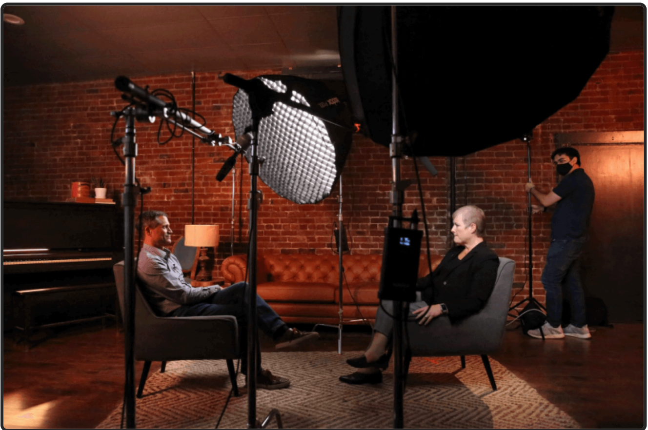
Capturing a live interview