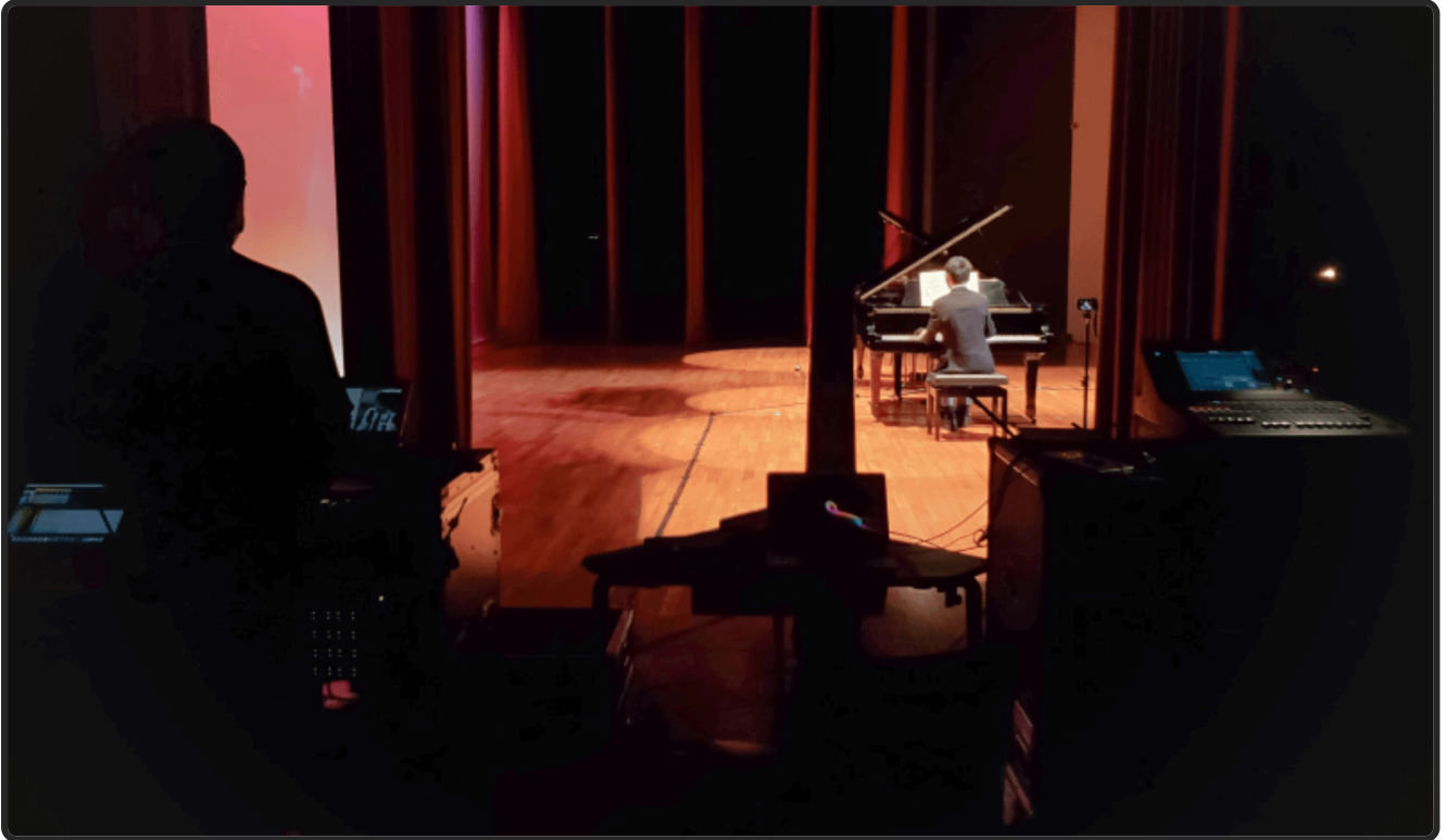
Behind the scenes of a piano performance

In performing arts production, harmonizing every aspect, from lighting to sound, is essential for an excellent performance. Theater productions, often repeating the same show, blend narrative-driven dialogues and actions with precise synchronization of music, movement, and visuals. Rundown software is an indispensable part of the production, ensuring flawless cue management and scene transitions.