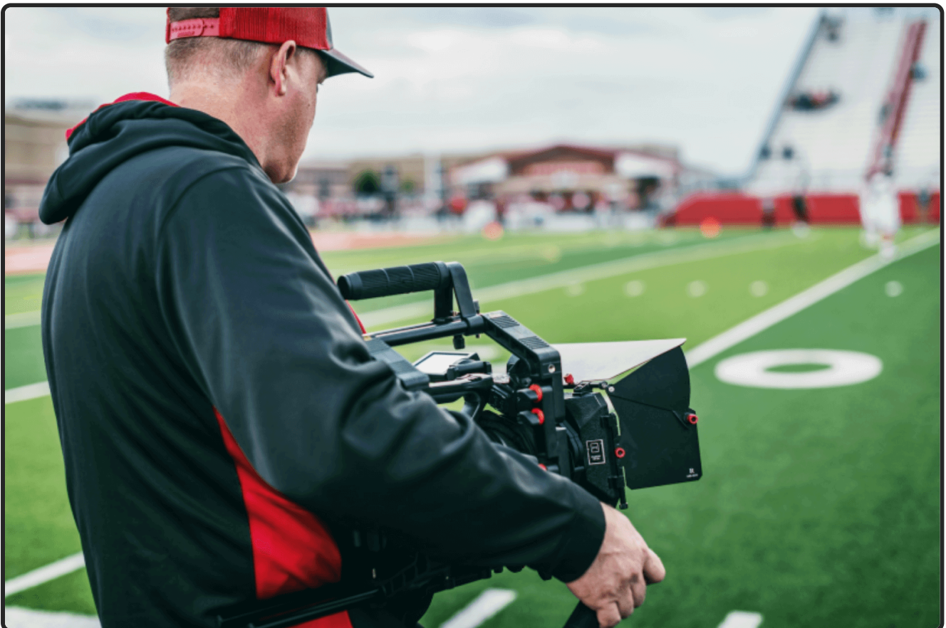
Field-side camera capturing the action

Live sports production thrives on quick decisions and flexibility, adapting to its unpredictable and action-packed nature. It demands rapid responses and meticulous