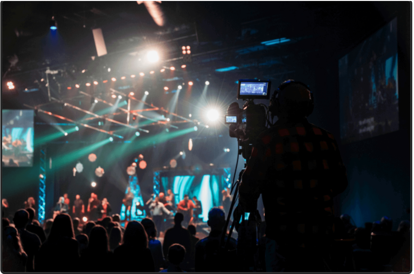
Live music concert being captured and live streamed

Show production covers various formats, including TV shows, live music concerts, and multiple forms of entertainment. Events such as conferences, trade shows, worship, and corporate events benefit from rundown software's coordination and collaborative functionality.